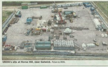
UKOG's site at Horse Hill, near Gatwick.