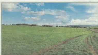
A picture taken by UKOG during a visit to the drill site at Arreton in February.

It also told landowners NFI insurance no longer covered environmental damage caused by oil works and that senior government officials had said if oil companies go bankrupt, the liability for clean-up operations could revert to the landowner. ● Cont. on page 6.